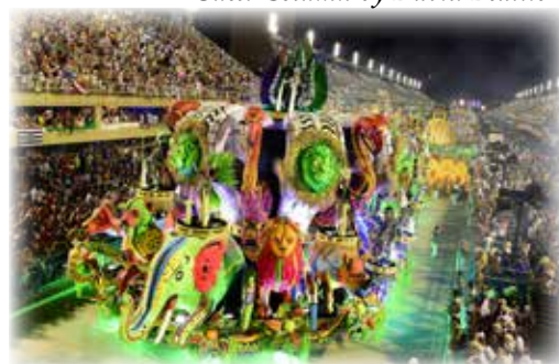
The "Party" is over, but the Real Celebration of Lent is Here.

With a part of my family living way down in N'awleans, all the fuss about "Fat Tuesday" has always intrigued me. What's with all the partying before really having to knuckle down for the 40 days of Lent and focus on the coming sacrifice of our Lord?