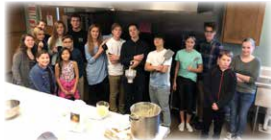
The CPC Flapjack Gang Rockin' the Kitch!

Flapjackin'... The youth held a Pancake Fundraiser for a digital monitor to be hung up in youth room! We raised way more than expected! Such a testimony to the support of our youth program! Thank you so much! We had the monitor up for the Super Bowl and we had such a great time enjoying food and the game!