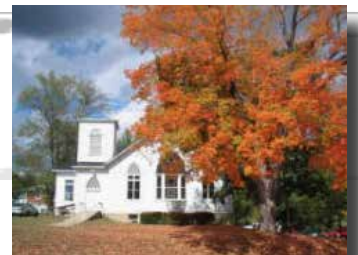
Annville Reformed Church, Kentucky

An Intergenerational Mission Trip July 15 through 20... is in the planning stages. We are in discussion with Grace Covenant Ministries (an RCA Mission focus) in Annville, Kentucky.