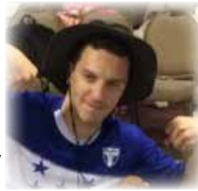
Hunter, Fearless Youth Leader

Goin' Strong! Central Park Church is about youth groups that are alive and full of energy and great activities... Programming is going well and we've been cookin' (literally)!